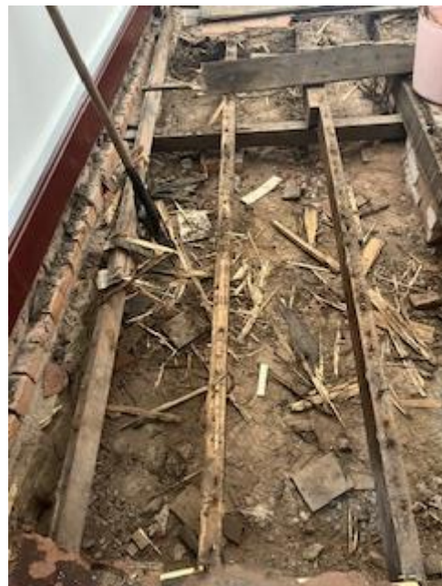
Vicars office below!