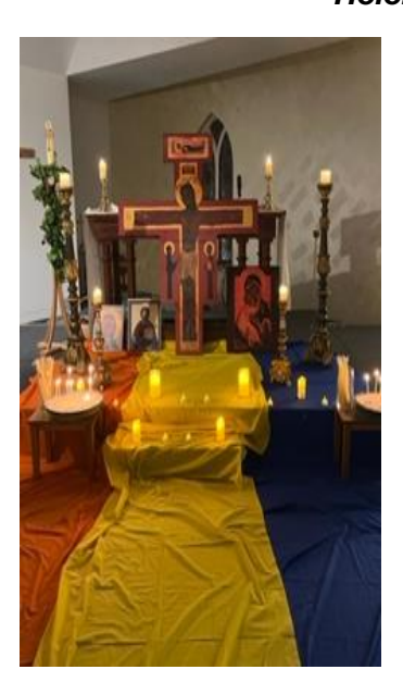
New large Taize cross is nearly ready and will be blessed at the Taize service 27/8/23