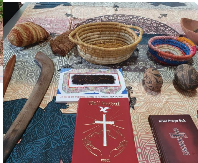
Items displayed in the hall on Aboriginal Sunday.