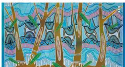
First Peoples' Assembly of Victoria 48 Cambridge St, Collingwood VIC 3066

Jhdara also shared his mother's family story from C 1831-35 when approximately 200 aboriginals (including members of his family) were removed from Tasmania to Flinders Island – a large number of whom died soon after removal.