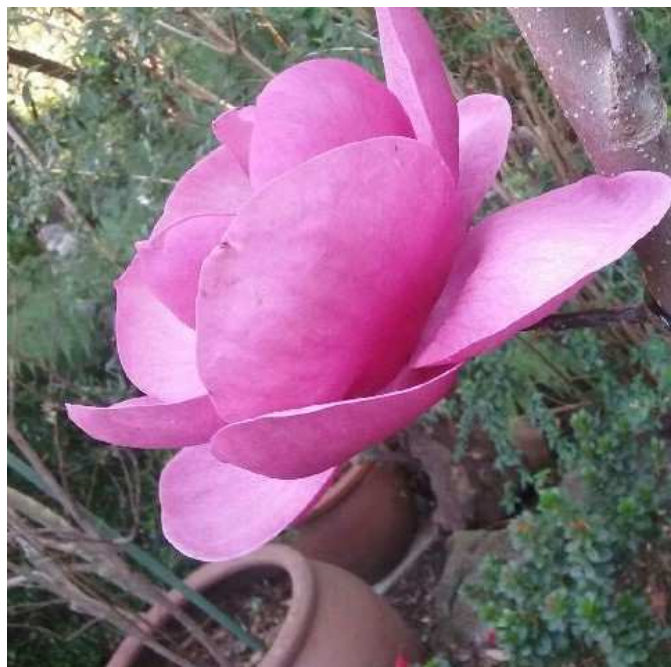
The beauty of spring in our garden cheers us up