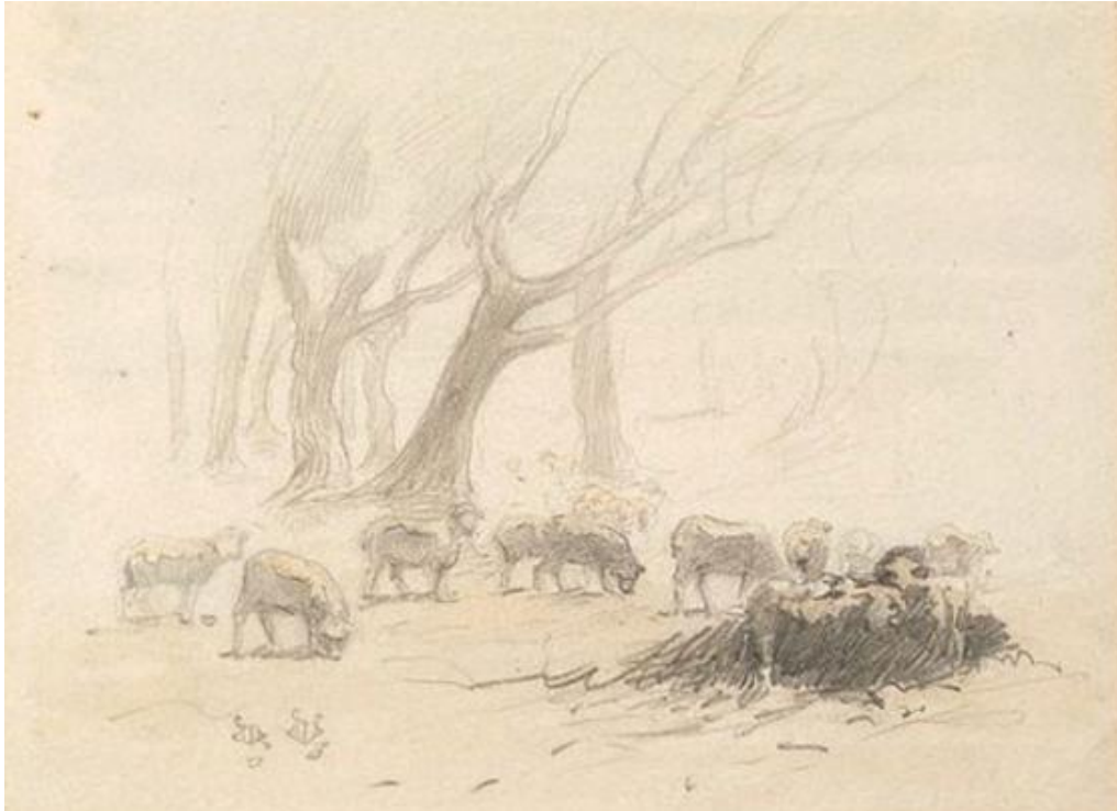
Walter Withers, Sheep grazing among trees at Heidelberg (1890)

The sheep that belong to me listen to my voice; I know them and they follow me (John 10:27)