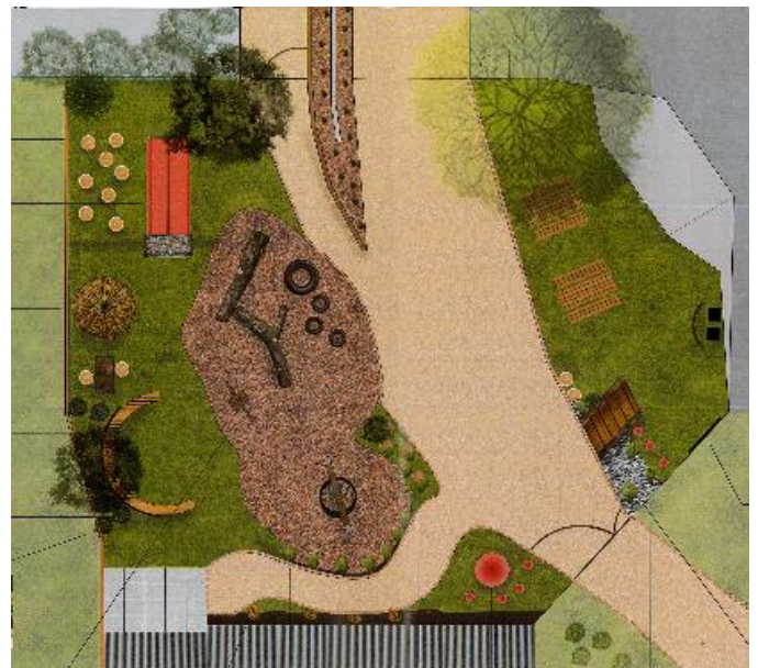
Landscaper's plan for play and entertaining area