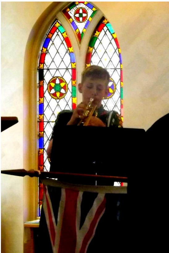
The last post is played.