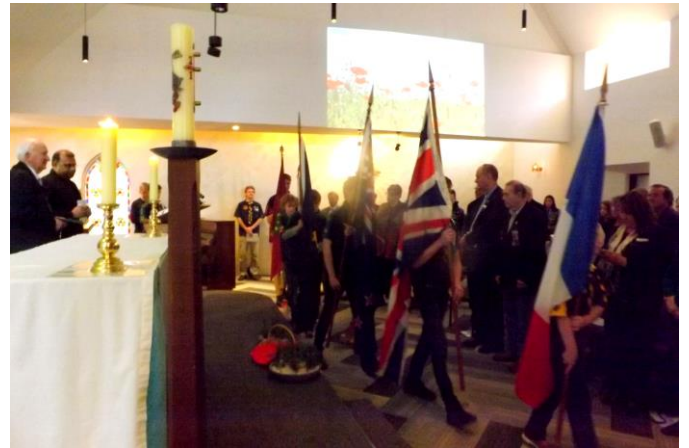
Final flag procession

Well done Discovering Spirituality Team for this service organisation and delivery. Being very well coordinated enabled the focus on the appalling happenings of 1916 and those that fell were respected and remembered.