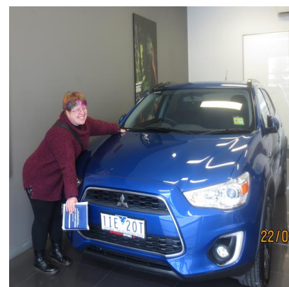
First meeting with 'Zachery' the New Mitsubishi ASX