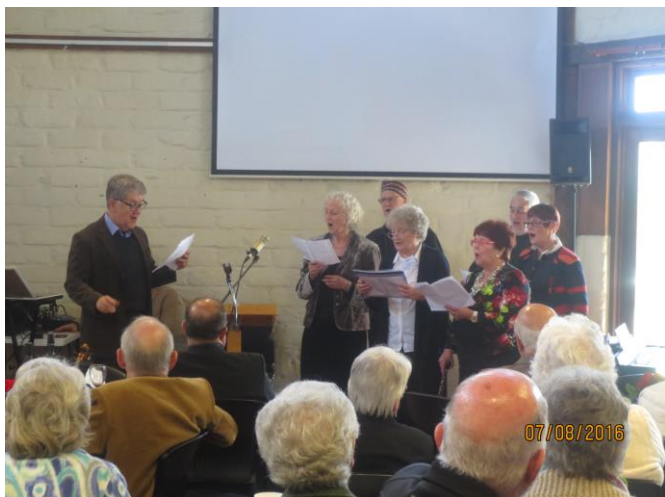
Our Choir singing at the Farewell concert after lunch

The concert that followed was a truly joyful time with singing, recitation of poems, stories and lots of